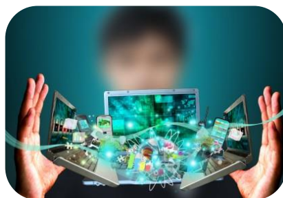
Research Branch of SECE