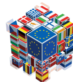
Research Projects in a Global Scale / Projects of (Scientific) Services