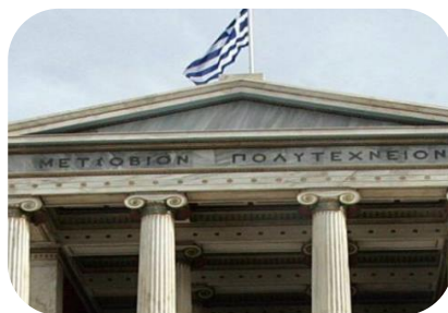
Oldest and Largest Academic Research Institute in Greece