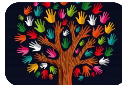
Characteristic Scientific Diversity of many Research and Development Projects